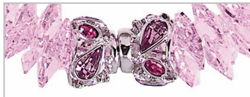
offset crystals for trend-setting modern style