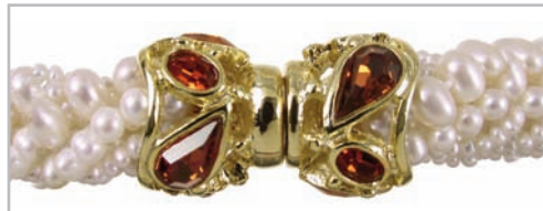
multiple strands of pearls for a tailored look