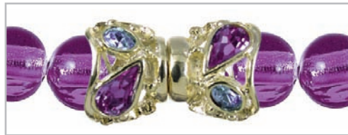
14mm bead tucks-in for a smooth transition

Clasp style: Mardi Gras Skill level: easy-medium Time approx: 20 minutes Crystals to glue: 10