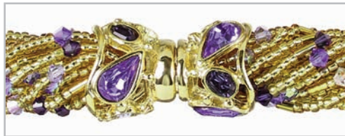
seedbeads & crystal flow together seamlessly