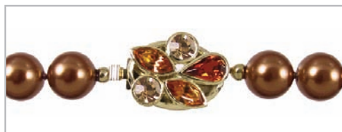
add an unexpected splash of sparkle to pearls

Clasp style: Montage Skill level: easy Time approx: 10 minutes Crystals to glue: 5 Size approx: 23x15mm Nickel-free plated finishes: • rhodium • gold plate