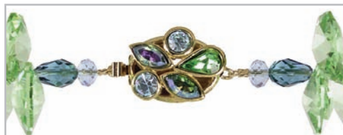
multiple crystal colors reflect necklace style