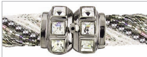
exotic and elegant ruthenium finish with crystal

Clasp style: Windows Skill level: easy Time approx: 10 minutes Crystals to glue: 6 Size approx. • Exterior: 27x21x12mm • Opening: 13x6.5mm Nickel-free plated finishes: • rhodium • gold • ruthenium